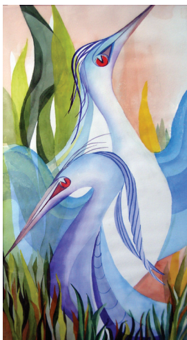
Bea Peskoe Art Committee