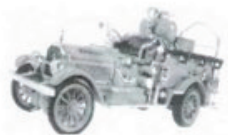
HISTORIC TOWN HALL MUSEUM