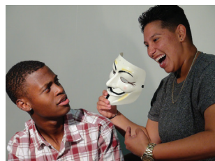
What If Works Theater

Among our other efforts, the Bea Peskoe Art Committee (BPAC) focuses on visual art and art related activities and promotes artists in the Homestead and surrounding area. Our varied affiliate organizations offer something of interest for everyone. A few examples are the Lamplighters Writers Group, the Children's Art Gallery, East Everglades Orchid Society, South Florida National Parks Camera Club, South Florida Woodturners Guild and our local museums.