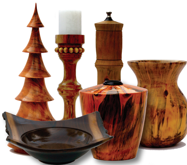
South Florida Woodturners Guild

Sponsor, patron and benefactor memberships are also available. For more information, go to homesteadcenterforthearts.com .