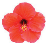
Woman's Club of Homestead